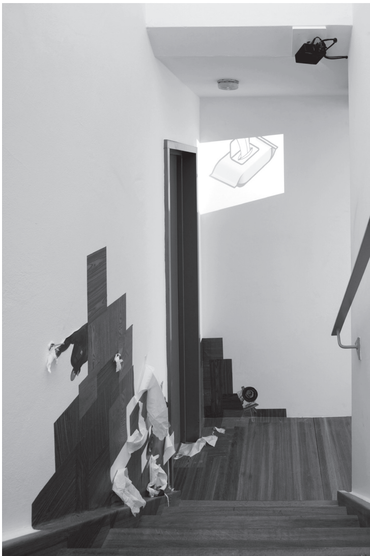
Julie Verhoeven Now wash your hands 2016

Are Beautiful , 2017, made for Marc Jacobs, sits high on the wall above its paltry companion Now Wash Your Hands , 2016, which plays at the entrance to the gallery toilet, congealed loo roll creeping out from under the door and up the steps. In the former, the recurrent motif of perfectly varnished, oblong false nails and colourful plastic-coated pills proliferate and come out of everywhere. Nails protrude from mouths, get stuck on painted lips and rattle around in cartoon gums; pills are squeezed from lemons and go round and round in washing machines. Fast and gaudy, its momentum rides on the heady joy of fashion and consumerism. Now Wash Your Hands , made during Verhoeven's residency at last year's Frieze Art Fair as a toilet attendant, combines this consumption with base bodily processes. A naked woman wears a harness of material 'turds', sanitary towels containing coins are caressed, the sheer volume of money, time, product and waste is celebrated but ridiculed.